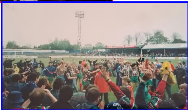
1995 Post-match title celebrations at Colchester.